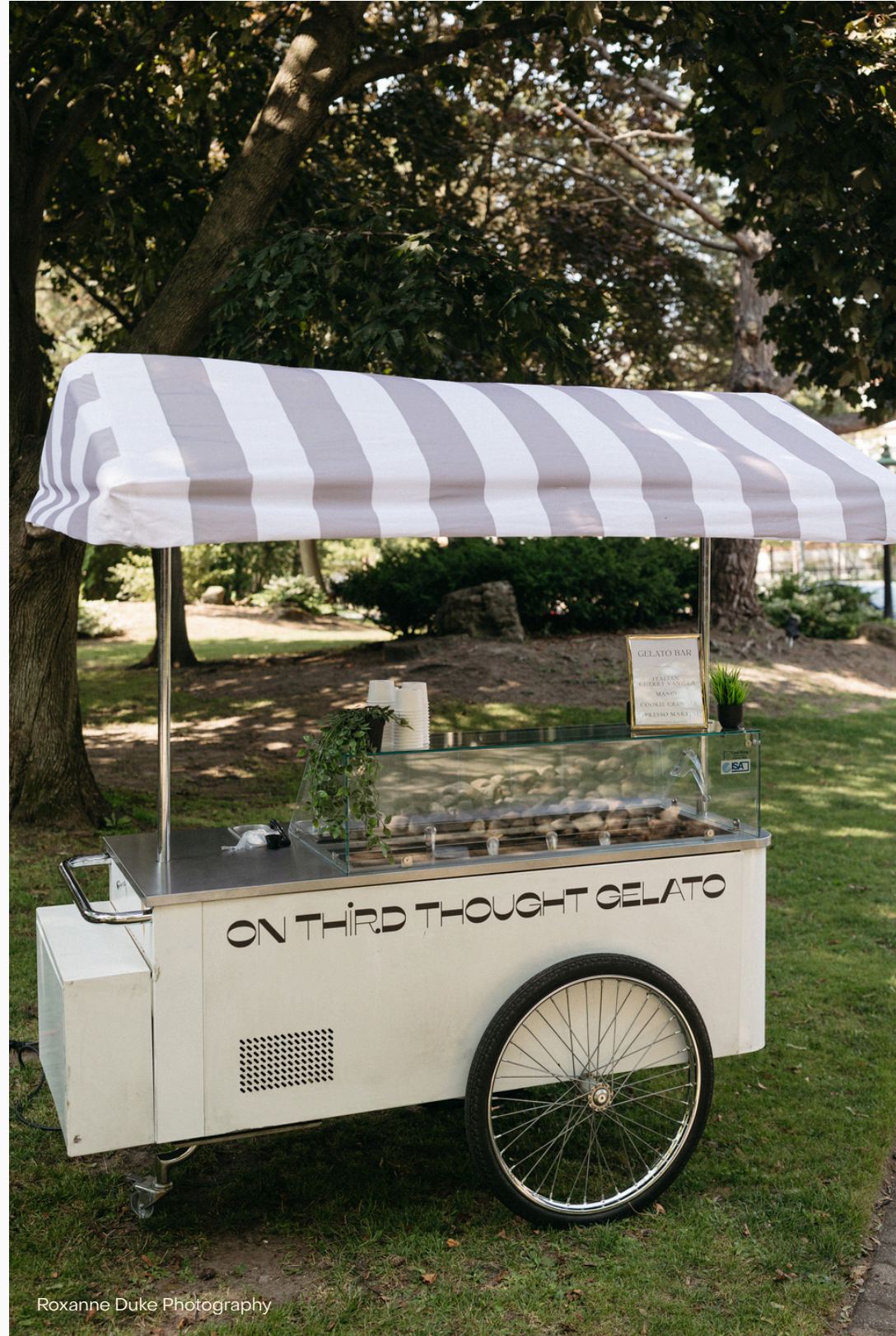
Roxanne Duke Photography